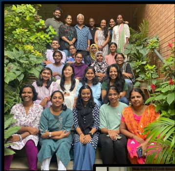
ATREE's sustainable futures workshop exploring the interrelated issues of climate change & poverty

Throughout the year, students have attended permaculture training and multi-level kitchen gardens cultivation - inspiring one student to start a sustainable agriculture collective; another decided she "would pursue a career in food security" and some students reporting "green" income.